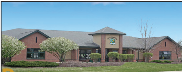
D 950 Fifth Street 10,938 sqft | Standalone building