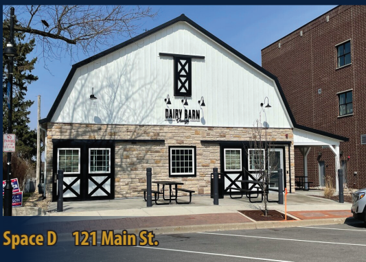
Space D 121 Main St.