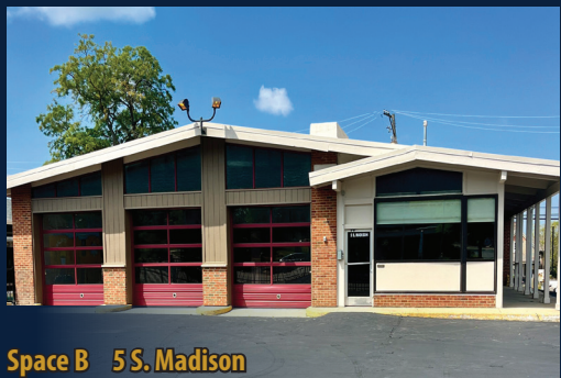
Space B 5 S. Madison