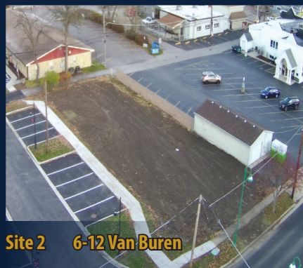
Site 2 6-12 Van Buren