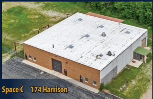
Space C 174 Harrison