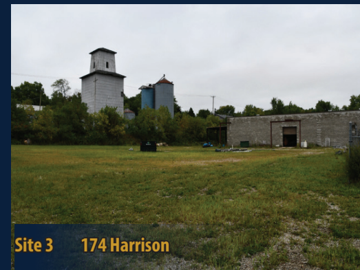
Site 3 174 Harrison