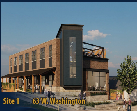
Site 1 63 W. Washington