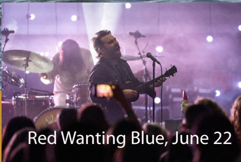
Red Wanting Blue, June 22