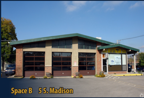
Space B 5 S. Madison