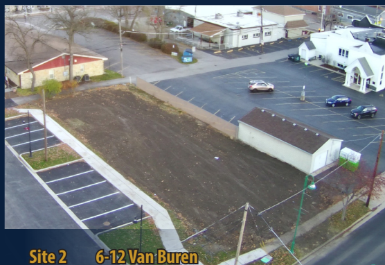
Site 2 6-12 Van Buren