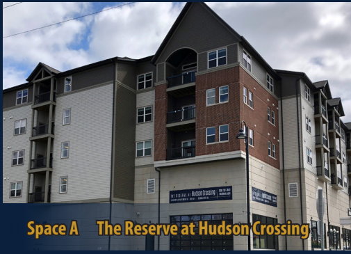
Space A The Reserve at Hudson Crossing