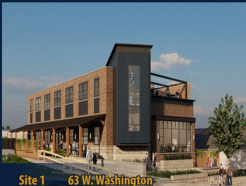
Site 1 63 W. Washington