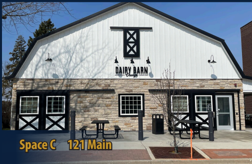
Space C 121 Main