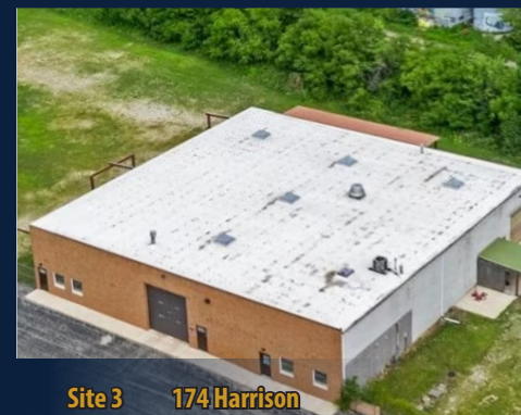
Site 3 174 Harrison