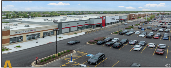
A Oswego Commons 20,554 sqft | Anchored by Target and Vasa Fitness