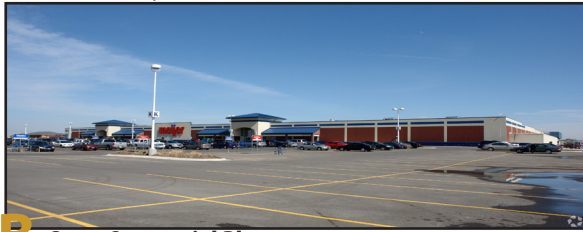
B Gerry Centennial Plaza 13,788 sqft | Anchored by Meijer