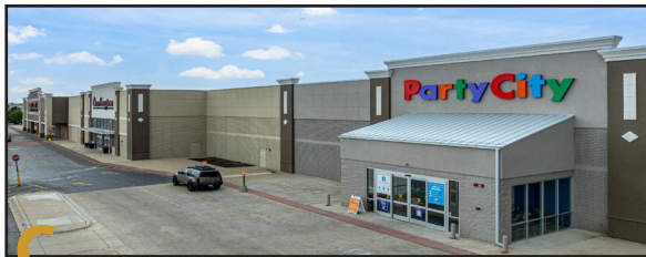
C Prairie Market 14,000 sqft | Anchored by Walmart/Kohl's