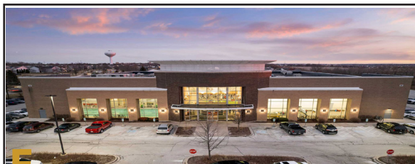
E 201 Ogden Falls Blvd 45,000 sqft | Standalone building