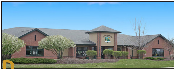
D 950 Fifth Street 10,938 sqft | Standalone building