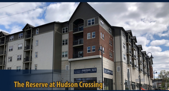
The Reserve at Hudson Crossing