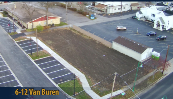
6-12 Van Buren