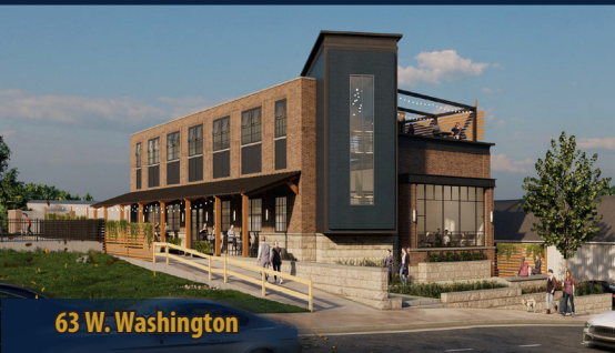
63 W. Washington