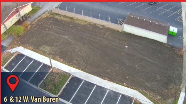
6 & 12 W. Van Buren