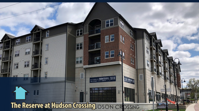
The Reserve at Hudson Crossing HUDSON CROSSING