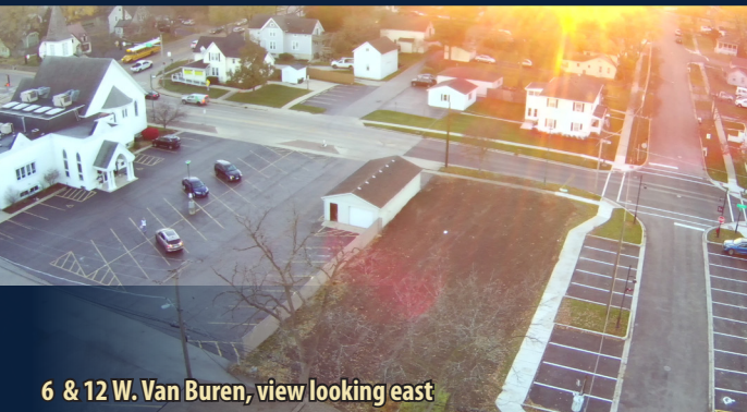
6 & 12 W. Van Buren, view looking east