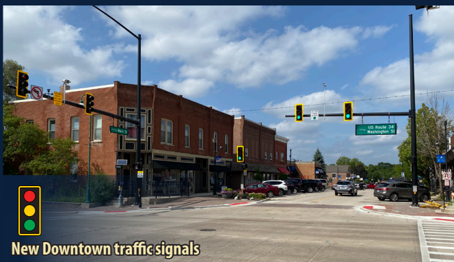
New Downtown traffic signals