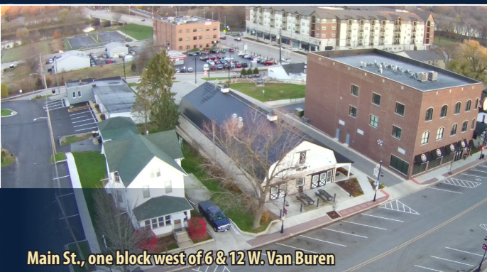
Main St., one block west of 6 & 12 W. Van Buren