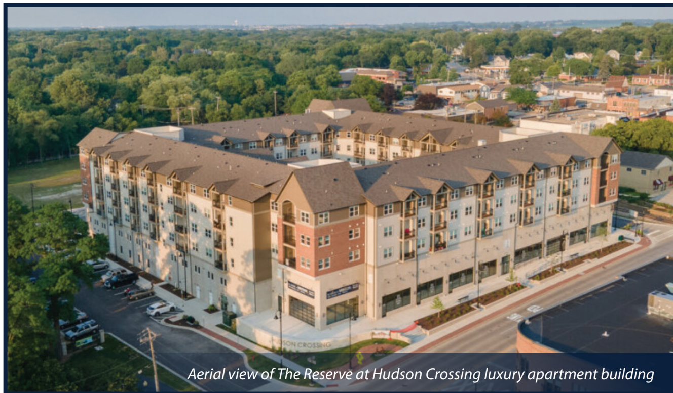
Aerial view of The Reserve at Hudson Crossing luxury apartment building