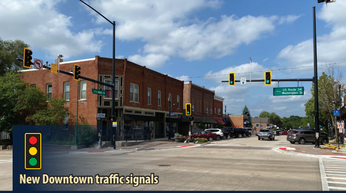
New Downtown traffic signals