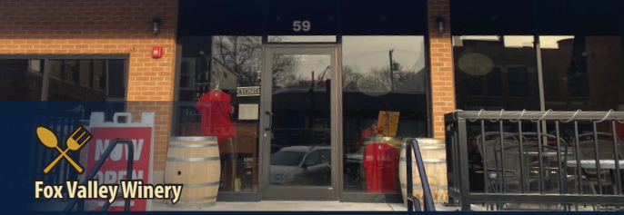
Fox Valley Winery