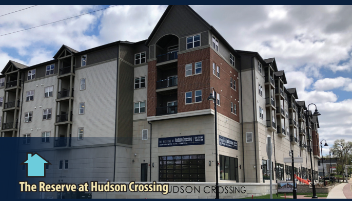
The Reserve at Hudson Crossing HUDSON CROSSING