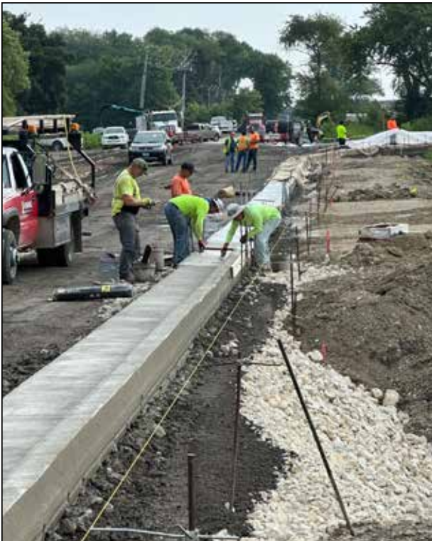
Wolfs Crossing construction

In August, the Kendall County Highway Department closed the intersection of Collins and Grove roads to all through traffic as construction begins on a new