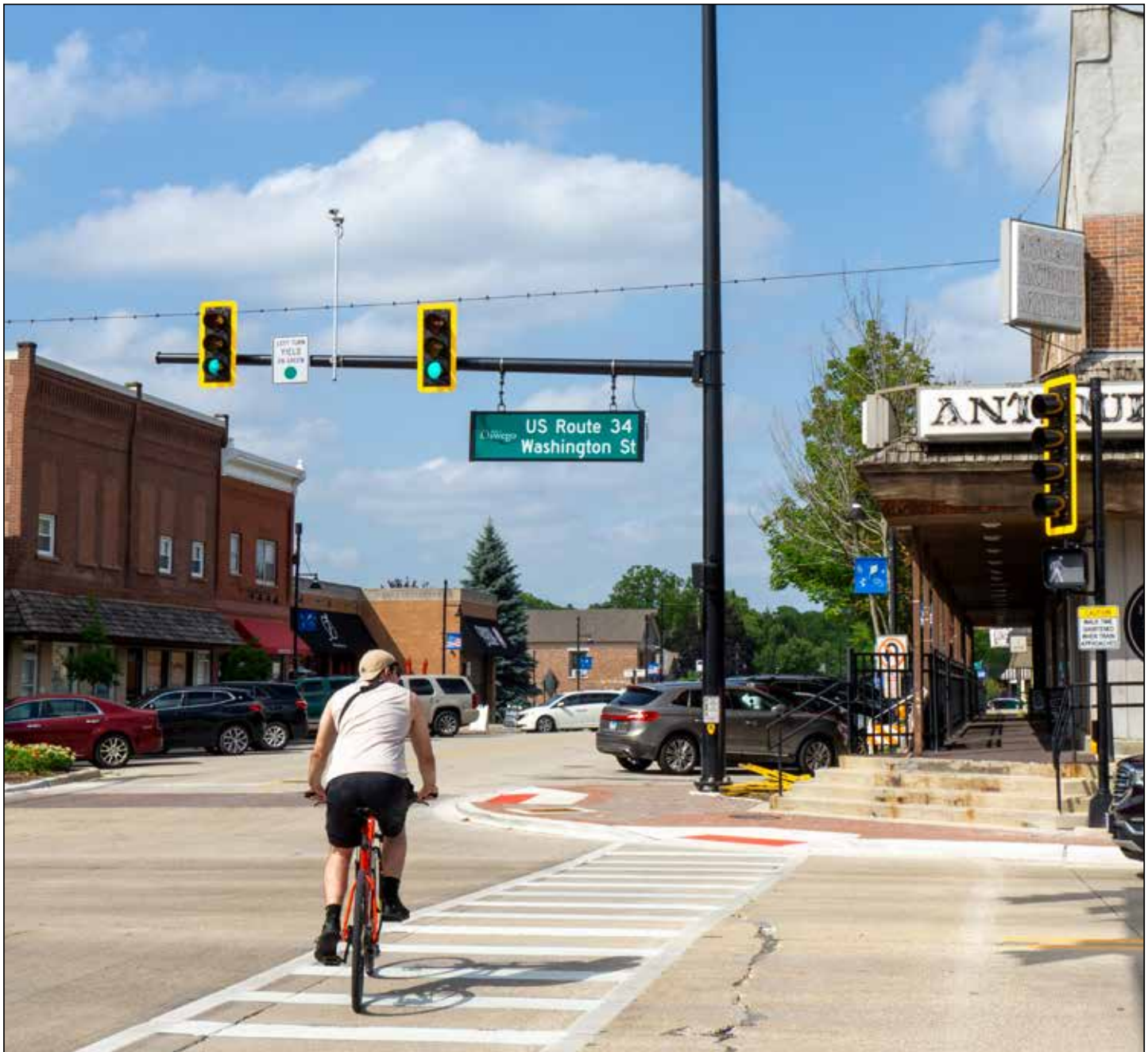
Installation of traffic lights on U.S. Route 34/Washington Street at the intersection of Main.