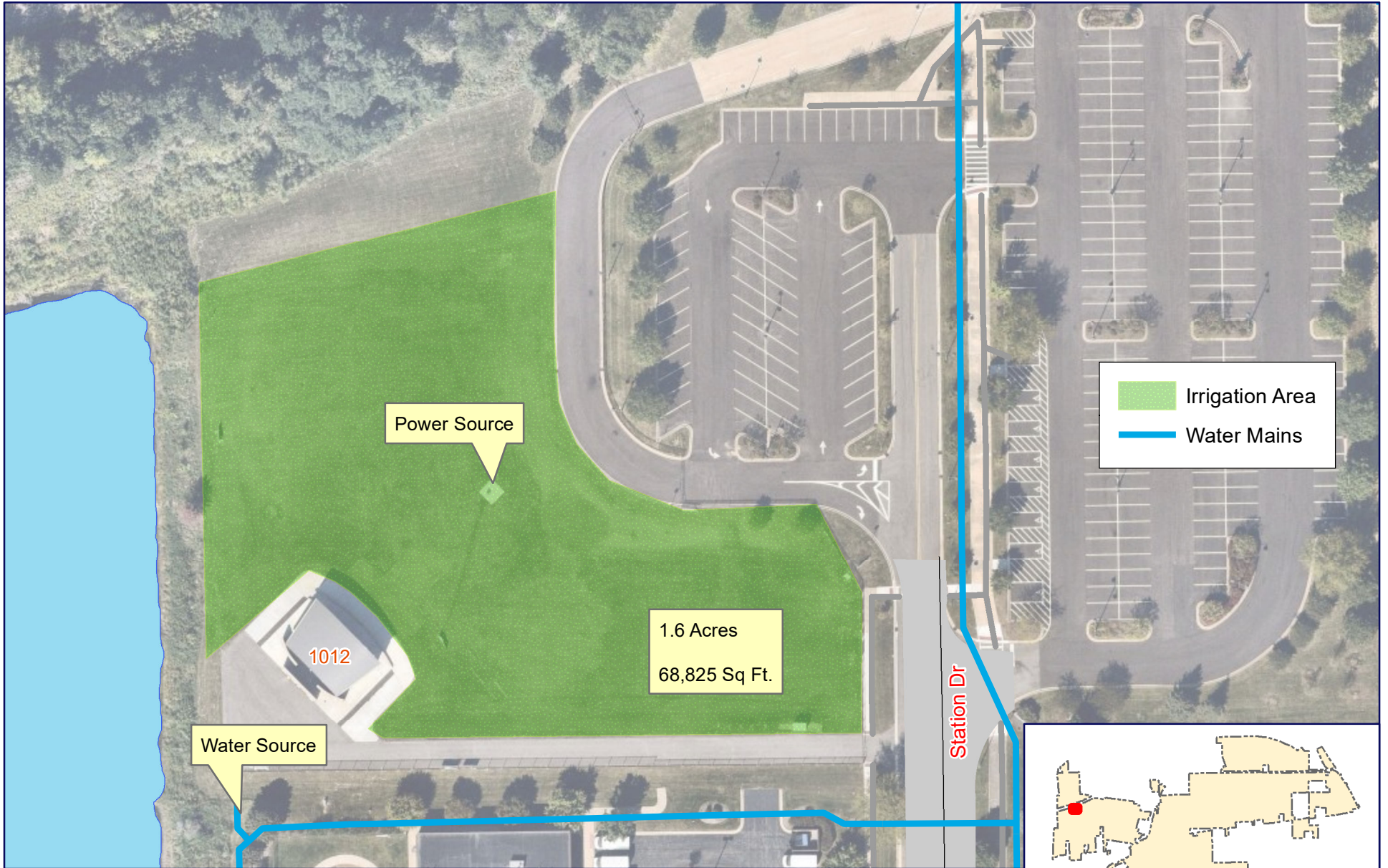
Exhibit A- Venue 1012