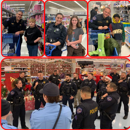
2022 Shop with a Cop

The Oswego Police Department, Meijer and School District 308 held our annual Shop with A Cop on December 6 th . Each child was partnered with a Police Officer to purchase gifts for themselves and family members. We always look forward to this annual tradition!