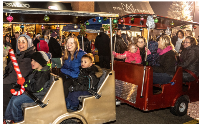
Thousands of Oswego residents join the holiday festivities of the beloved Christmas Walk each year. Engage with families at a booth or through a sponsorship!

Rates and sizes for ads are available at www.oswegochristmaswalk.com . A program listing is free for organizations participating in Christmas Walk festivities.