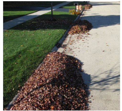
Improper leaf piles, in the street. Leaves in the street clog drains, causing flooding.