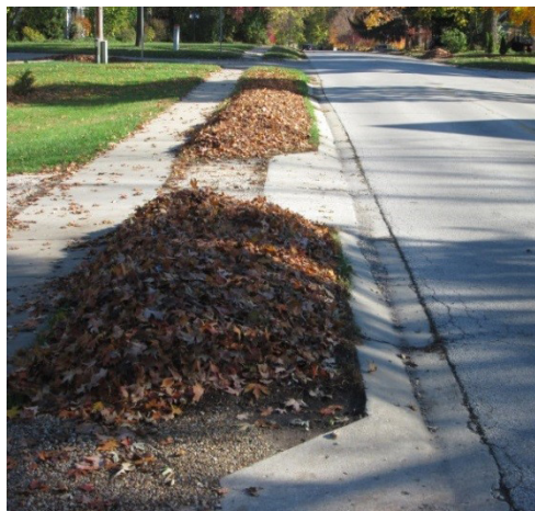
Proper leaf piles, up on the curb. Leaves are not piled long enough to kill grass.

Leaf collection dates may be subject to change due to inclement weather, staffing, potential equipment issues and leaf volume.