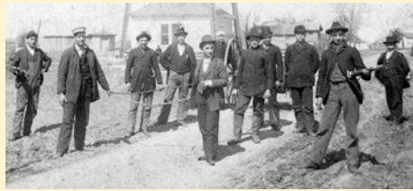
Members of Oswego's volunteer fire company – 1895

Fires were common occurrences in and around Oswego during the early days of the village. Many of the town's structures at that time were built using lumber and were heated with either coal or wood-burning stoves. Nearly every week, the local newspaper reported on another fire. Buildings that went up in flames included houses, barns, mills, grain elevators, schools, churches, and even ice houses.