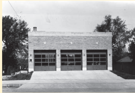
Oswego Fire Station #1 – 1958

Construction crews broke ground for the fire station in November 1953. The Oswego Ledger reported that the building would have two levels – a basement and a ground floor – accessible for the fire crew's equipment. Projected cost to construct the building was about $28,000.