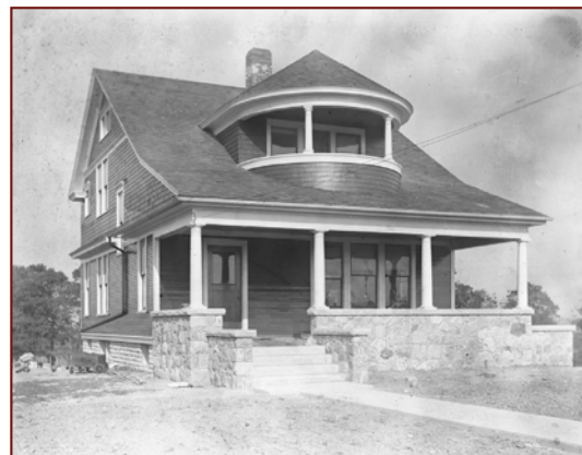
The Cutters' house at the time of its construction, 1903

His shop was mentioned many times in the Kendall County Record, including this reference published in the October 30, 1901 edition of the newspaper: "A well-appointed drug store is a necessity in [e]very town, and Oswego