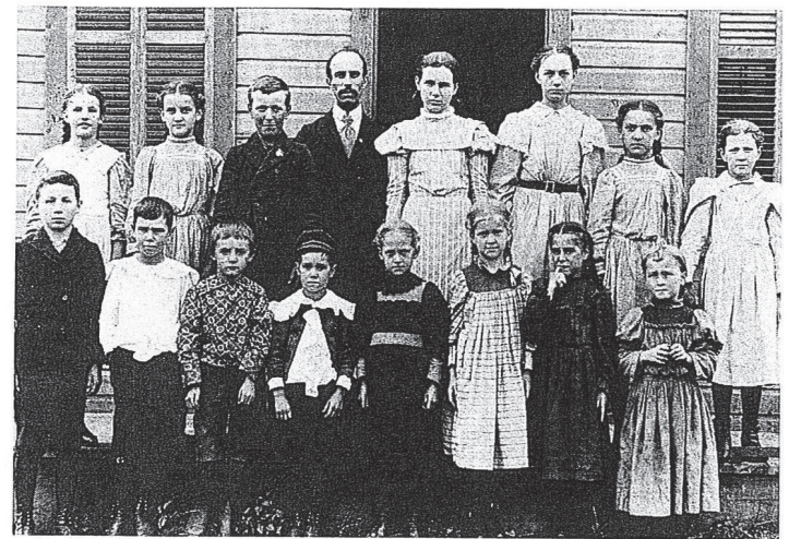
Gaylord School on Plainfield Road in Oswego Township in the late 1800's Class